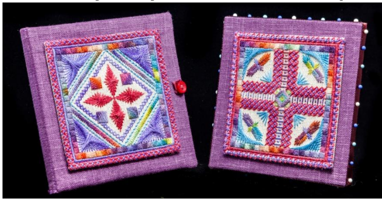
Above photo is Kaleidoscope colorway on white canvas 2 projects: Needle Case and Pin Keep